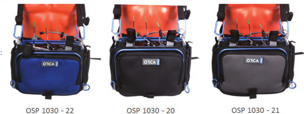
OSP 1030 - 22