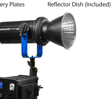
Quad V-Mount Battery Plates