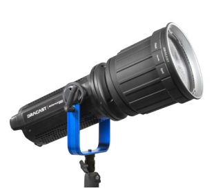
DRF2XATM Spot / Flood Lens