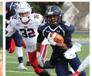
FAST ACTION SPORTS