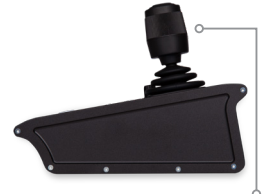
Hardware Option: Hall Effect joystick for increased precision and ergonomics of operation

With dedicated buttons and knobs for all settings and actions, it's easy and quick to use. You will enjoy all the same benefits as found on PTZ Fly, while having a larger hand rest and faster, direct access.